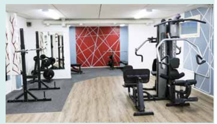
VTS-kodit has four neighbourhood gyms, this one is situated in Lielahti, Tampere.

We are also in the process of updating our other services. For example, we recently put our broadband service, which is included in your rent, out to tender, as a result of which broadband speeds are now being increased to ten times what they were before.