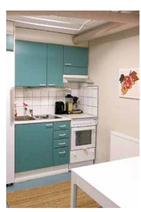
The kitchen cupboards of the club room are the original ones. However, washing the doors and adding new handles enhanced the appearance of the entire kitchenette.

"The club room has no windows, so the lack of natural light was a challenge. But now that the room