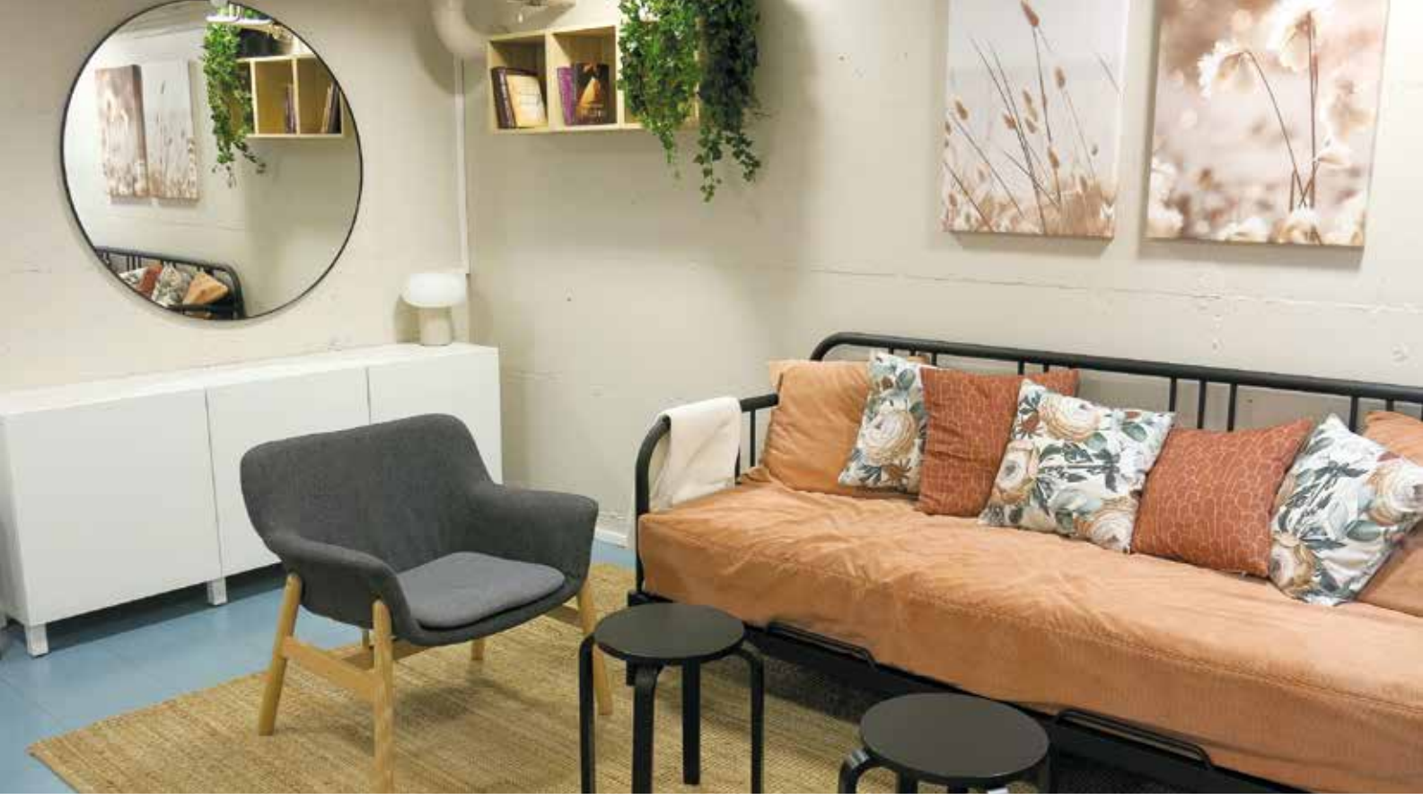
The renewed Possilankatu club room is comfortable and well-suited to many different purposes.